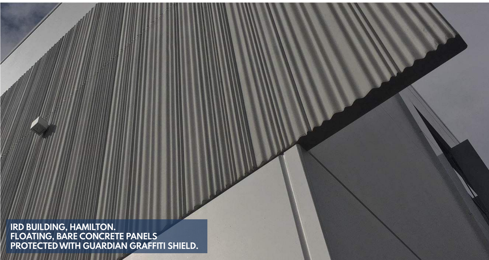
IRD BUILDING, HAMILTON. FLOATING, BARE CONCRETE PANELS PROTECTED WITH GUARDIAN GRAFFITI SHIELD.